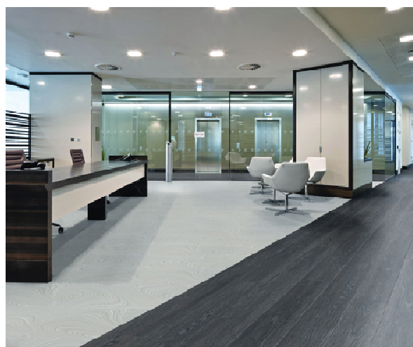
Figure 1 Expona Design LVT