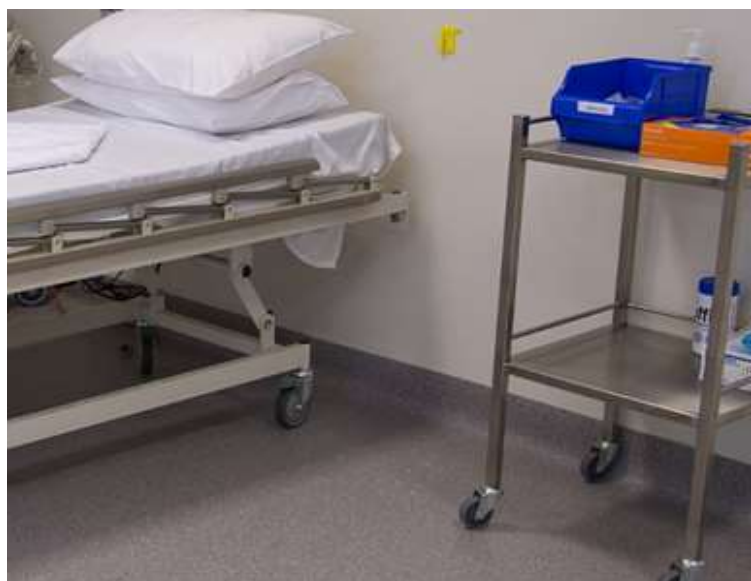
Figure 1 Accolade Safe