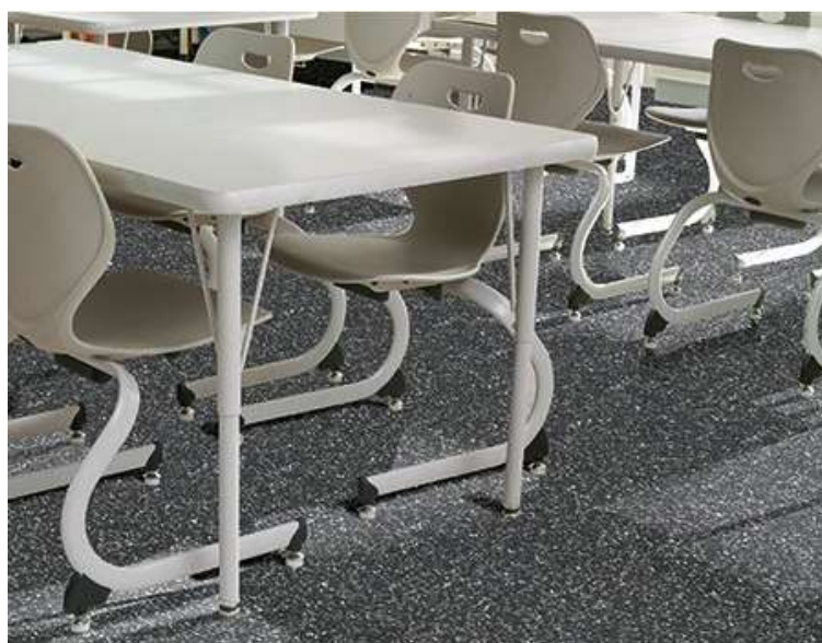
Figure 1 Australis